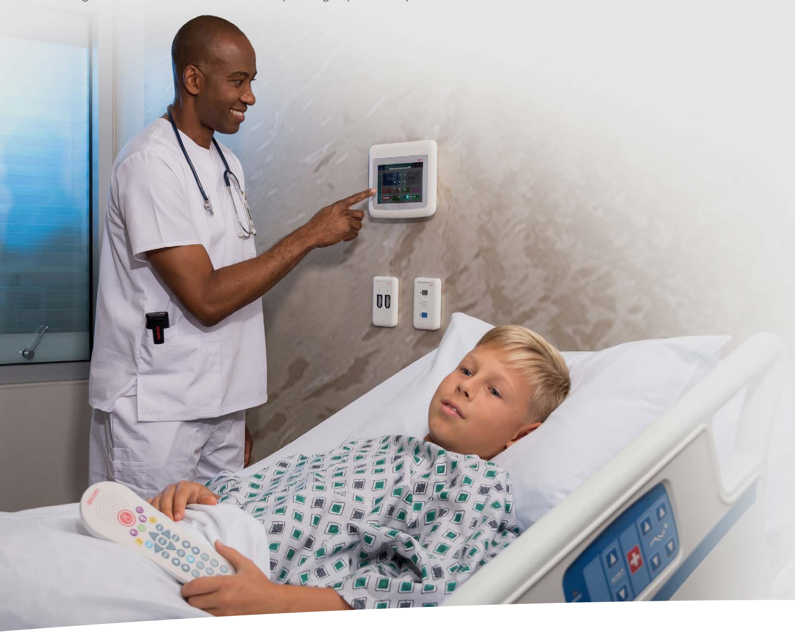
Quick Charting via Ascom TelliConnect Station

Telligence from Ascom is the world's first Patient Response System. With Telligence, caregivers now have relevant information at the point of care and throughout the care process. Built on the Ascom Healthcare Platform that collects information from multiple sources (the patient, medical devices, healthcare applications and other systems), Telligence gives clinicians a more comprehensive view of the patient's status that goes well beyond traditional nurse call. As a result, caregivers are better informed when responding to patient requests.